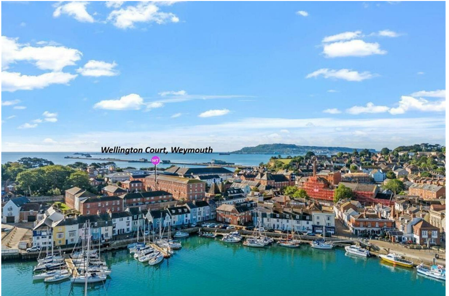
Wellington Court, Weymouth